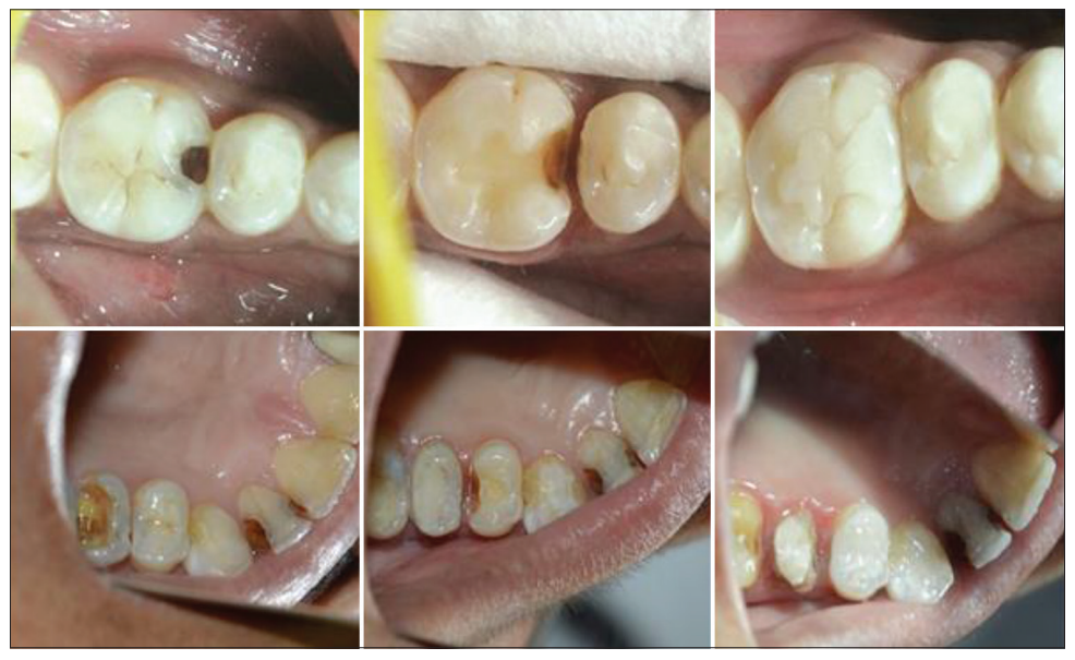
Figure 7: Class II inlays in Rt mandibular 1st molar (Zirconia) & Rt maxillary 1st premolar (BioHPP PEEK)

While assessing sensitivity, 10% of the patient complained of sensitivity in BioHPP PEEK inlay restored teeth and 15% showed response to sensitivity in the zirconia inlay group and was statistically insignificant (P = 0.10), [Table 7].