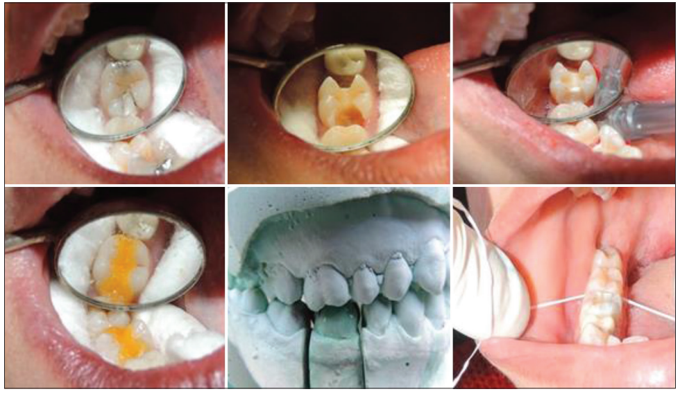
Figure 3: MOD class II inlay in Rt mandibular first molar (inlay type: BioHPP PEEK)

Similarly, when marginal discoloration was assessed, at 03 months only one case showed slight staining in the BioHPP PEEK group (P = 0.31). At 6-month interval, 10% in Group A and 5% in Group B showed mild stains (P = 0.54). By 01 year, three patients reported with slight staining and one with moderate discoloration at restoration tooth interface in Group A and two patients showed only mild staining in Group B (P = 0.37). The color match of all the inlays in both the groups was satisfactory and did not vary much from the baseline to the 01 year follow-up except for one inlay in both the groups (5%), [Tables 3 and 4].