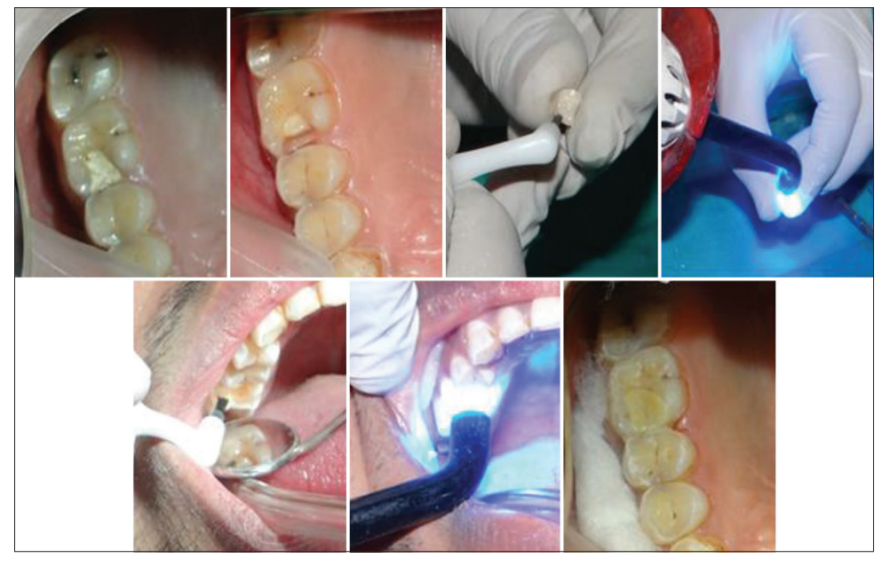
Figure 6: Class II inlay in Rt maxillary 1st molar (zirconia)

During the assessment of surface texture, one inlay each in both the groups showed rough gritty texture during 3-month, 6-month, and 1-year observation period. Thus,